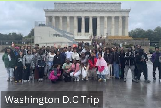
Washington D.C Trip