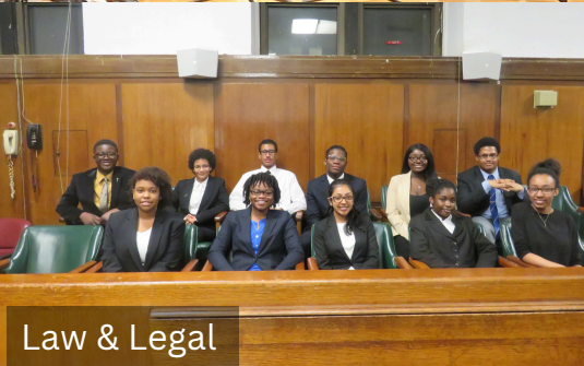
Law & Legal