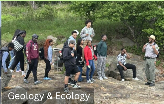
Geology & Ecology